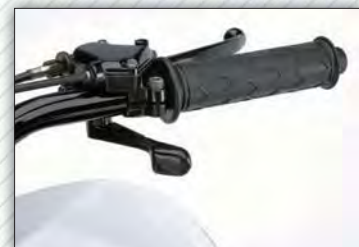
Power Limiting Systems