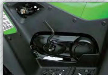
Continuously Variable Automatic Transmission